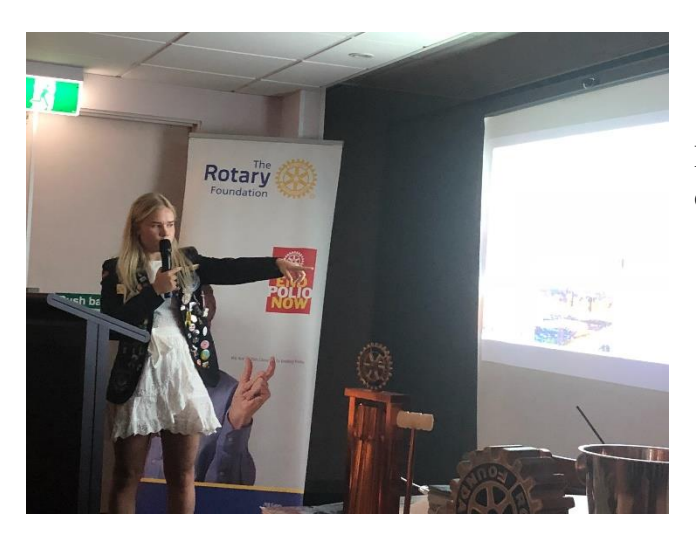
From the 5 hours car trip with the polish exchange student.

I had my presentation about my home, family and time in Australia so far to my Rotary club.